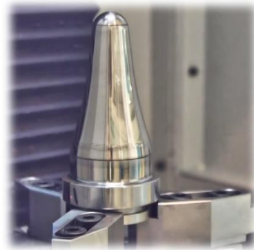
Pneumatic Gripping Chuck