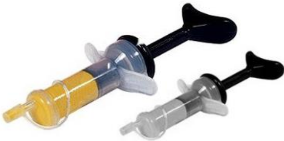
Performance tested Diamond compounds