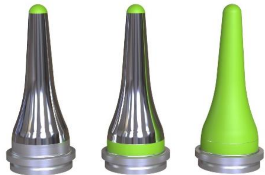
Multiple Polishing Area Selection